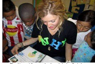
Checking out the scrapbook made by her first class

"You must be the change you wish to see in the world" --Mahatma Gandhi