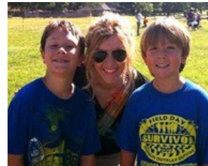
Field Day Fun