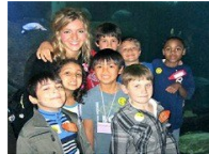
Having fun at the Dallas World Aquarium