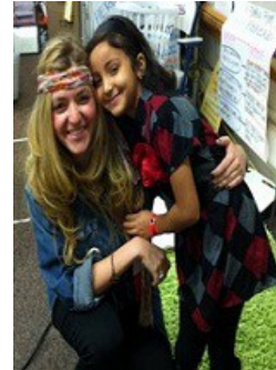
Red Ribbon Week: A student dressed as "Miss Kranz"